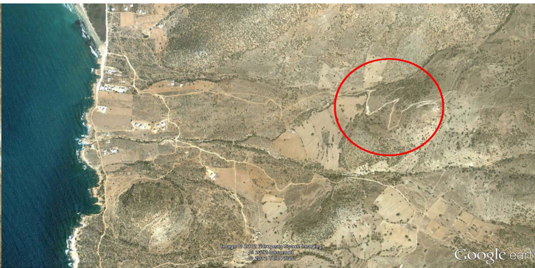
Location of property:

Agiasos area, 1200m from the beach on the sides of a hill at an elevation of 150 – 200 providing excellent and open view to the Aegean sea.