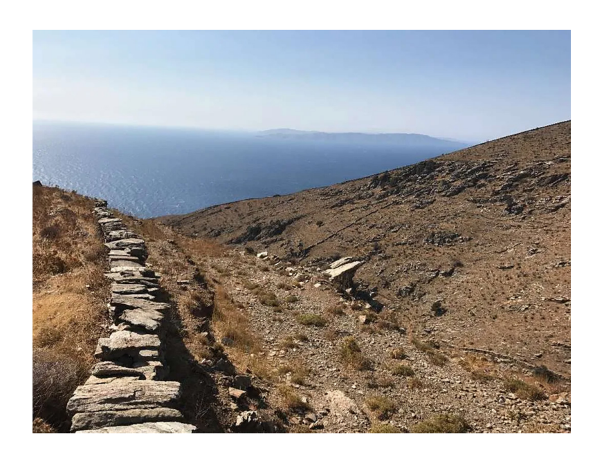
SEA VIEW PLOT – KEA, CYCLADES