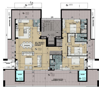
Κάτοψη Δ' Όρόφου

Στον τέταρτο όροφο γίνεται η είσοδος για το αεροδιαμέρισμα στο οποίο διαμορφώνεται η κουζίνα, η τραπεζαρία και το καθιστικό καθώς και τρία υπνοδωμάτια. Η εσωτερική κλίμακα οδηγεί στην σοφίτα όπου βρίσκεται ένα ακόμη υπνοδωμάτιο καθώς και μία αποθήκη. Τα υπνοδωμάτια είναι όλα master καθώς διαθέτουν ατομικό μπάνιο και γκαρνταρόμπα. Επιπλέον το αεροδιαμέρισμα διαθέτει την δικιά του ιδιόκτητη πισίνα.